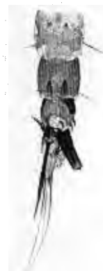
CAUDAL EXTREMITY OF LARVA