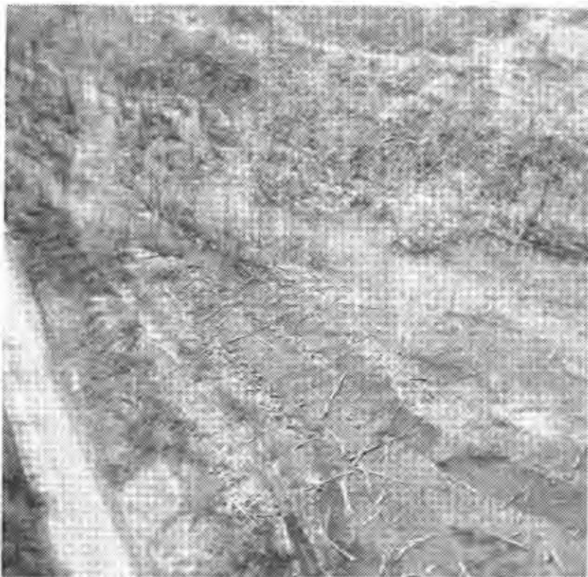
FIGURE 4. Aerial photograph of a marsh area in Pittsylvania County that supported larval populations of Anopheles crucians , A. quadrimaculatus , A. punctipennis , Culex restuans , C. territans , and Uranotaenia sapphirina .

King, et al. (1960) found that in the vicinity of Lake Apopka in Central Florida, where A. crucians becomes extremely abundant, the num-