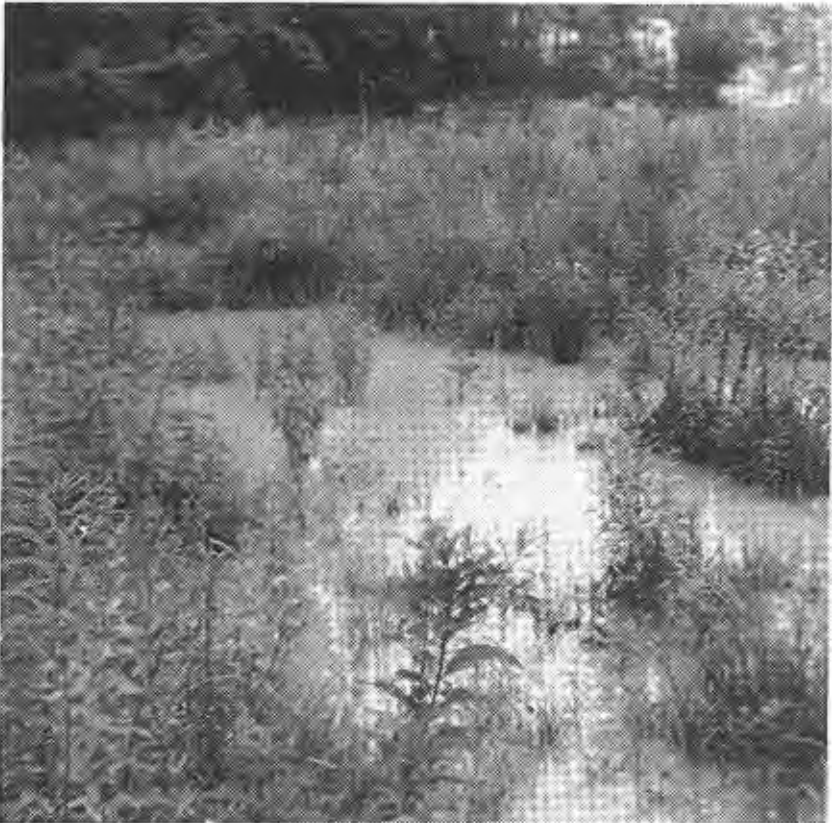
FIGURE 1. Temporary rain pool breeding habitat of Aedes vexans , Aedes canadensis , Psorophora confinnis , and Anopheles punctipennis in Franklin County.