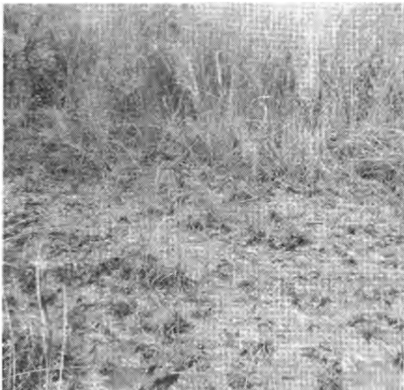
FIGURE 3. Hoofprints filled with water polluted by animal wastes which supported larvae of Aedes vexans .