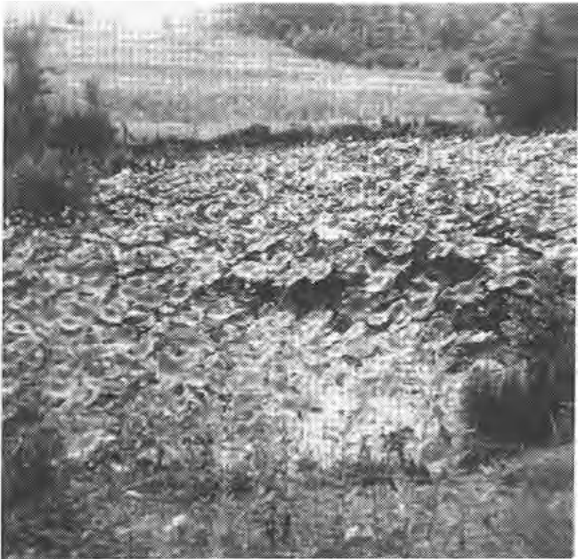
FIGURE 6. Tobacco irrigation pond which supported small numbers of Anopheles punctipennis larvae.

A marsh (Fig. 4) in Pittsylvania County also provided an extensive breeding area for A. quadrimaculatus . In the case of A. quadrimaculatus , it is a common practice to limit control measures to a radius of from one-half to one mile from habitations, depending on intensity of breeding, since many authors believe that few migrate farther than a mile from their breeding grounds.