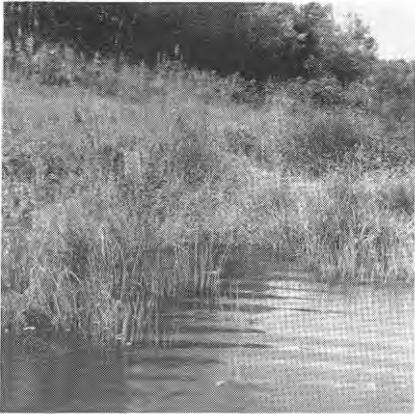
FIGURE 5. A portion of a small cove which represented a typical breeding site of Anopheles punctipennis and Culex salinarius on Smith Mountain Lake.

Anopheles quadrimaculatus Say:—Before malaria was so effectively suppressed in the United States, A. quadrimaculatus constituted a most severe disease threat in this country. It was without question the prime transmitting agent of the causal organism of malaria in the East.