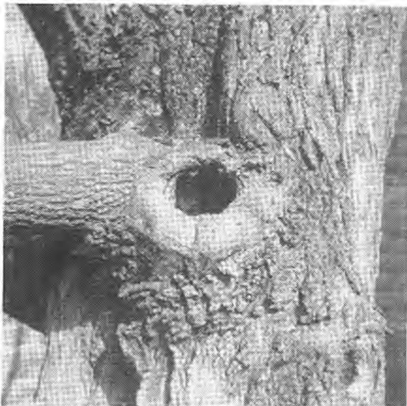
FIGURE 2. Tree-hole breeding site of Aedes triseriatus .

Aedes trivittatus (Coquillett):—Very little is known of the bionomics of this mosquito species. Although widely distributed, A. trivittatus is generally rare in most localities and is seldom encountered. Adults were